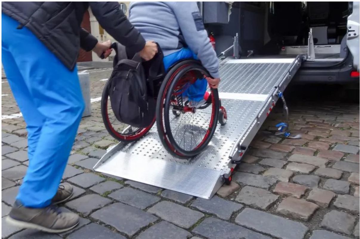
The Disabled face Challenges Voting in the Election

The Blind and Wheelchair Users Encounter issues with Absentee Ballots and Polling Places