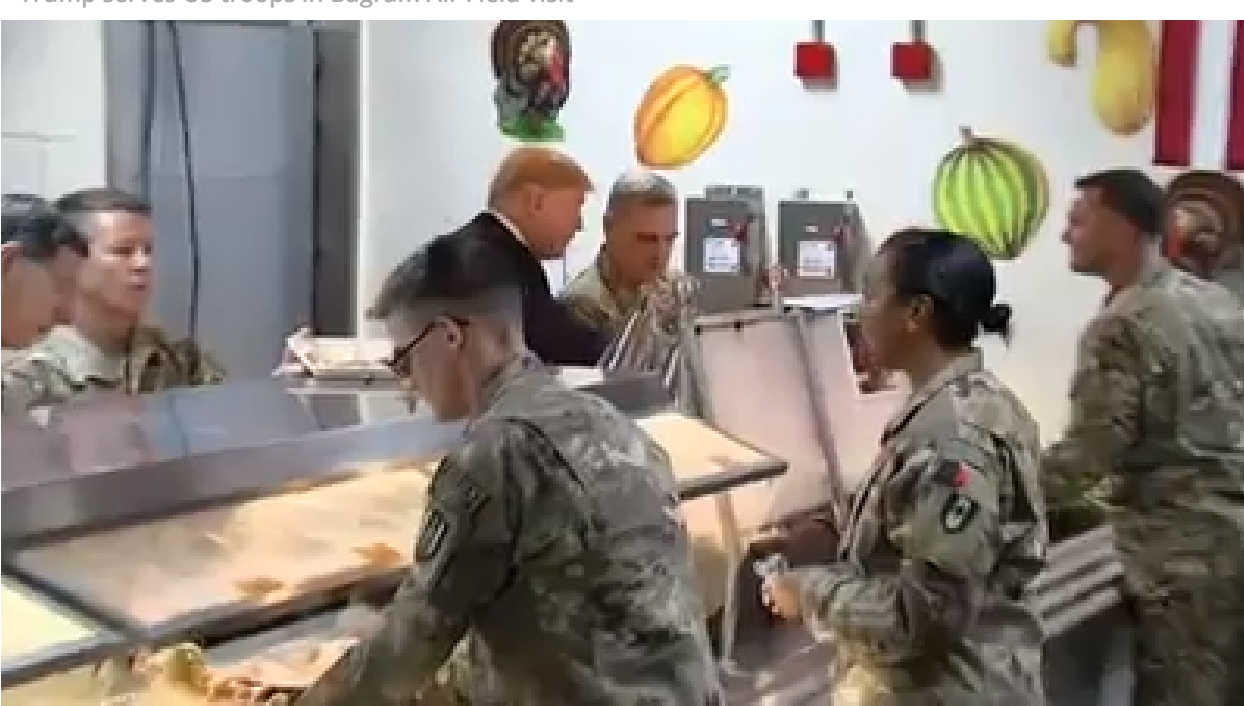
Trump serves US troops in Bagram Air Field visit

The group made a dozen recommendations in the report to the Department of Mental Health and Addiction Services and state legislators. The proposals include independently investigating all unanticipated deaths; getting rid of punitive patient treatment that undermines therapy; training police on patients' rights; and removing CVH's statutory exemption from psychiatric hospital licensing requirements.