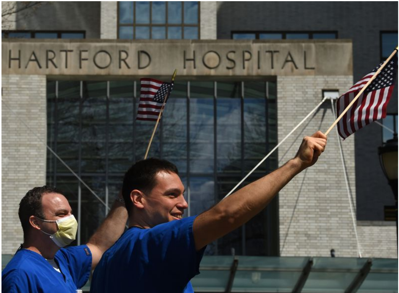
Hartford Hospital health care professionals wave to Hartford firefighters and police officers who drove past the hospital April 7 with their lights on in a show of support for health care workers.

The state of Connecticut has issued an executive order that will ensure people with disabilities are allowed a companion in hospital settings, after a group of disability rights advocates filed a civil rights complaint last month.