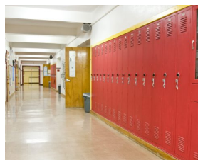
Two Bills Raise Concerns about Funding for