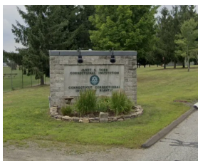
Former Prisoners, Staff, Activists Testify