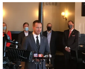
Federal Aid Announced to Compensate