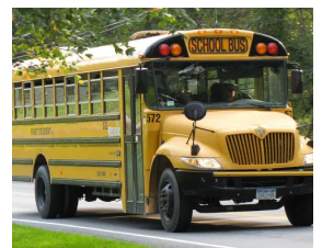
Legislators Debate Two Alternative Funding