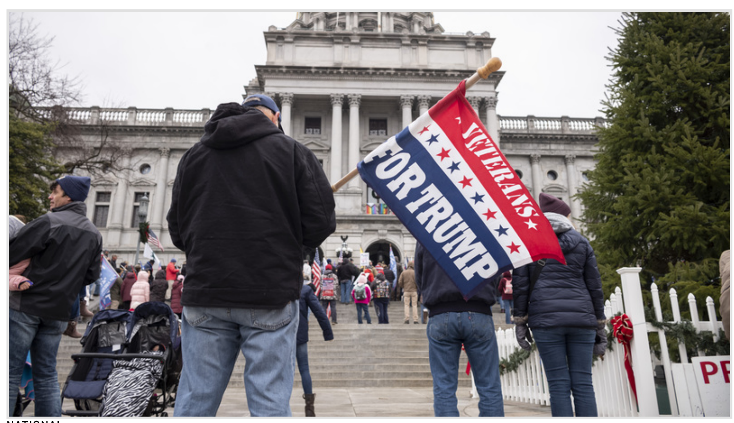
NATIONAL In Explosive Debate, Pa. GOP Refuses To Swear In Reelected Democratic Senator