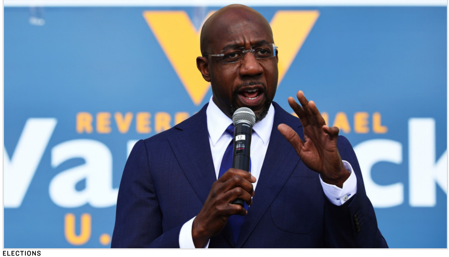
'Welcome To The New Georgia': Raphael Warnock On His Win In Senate Runoff