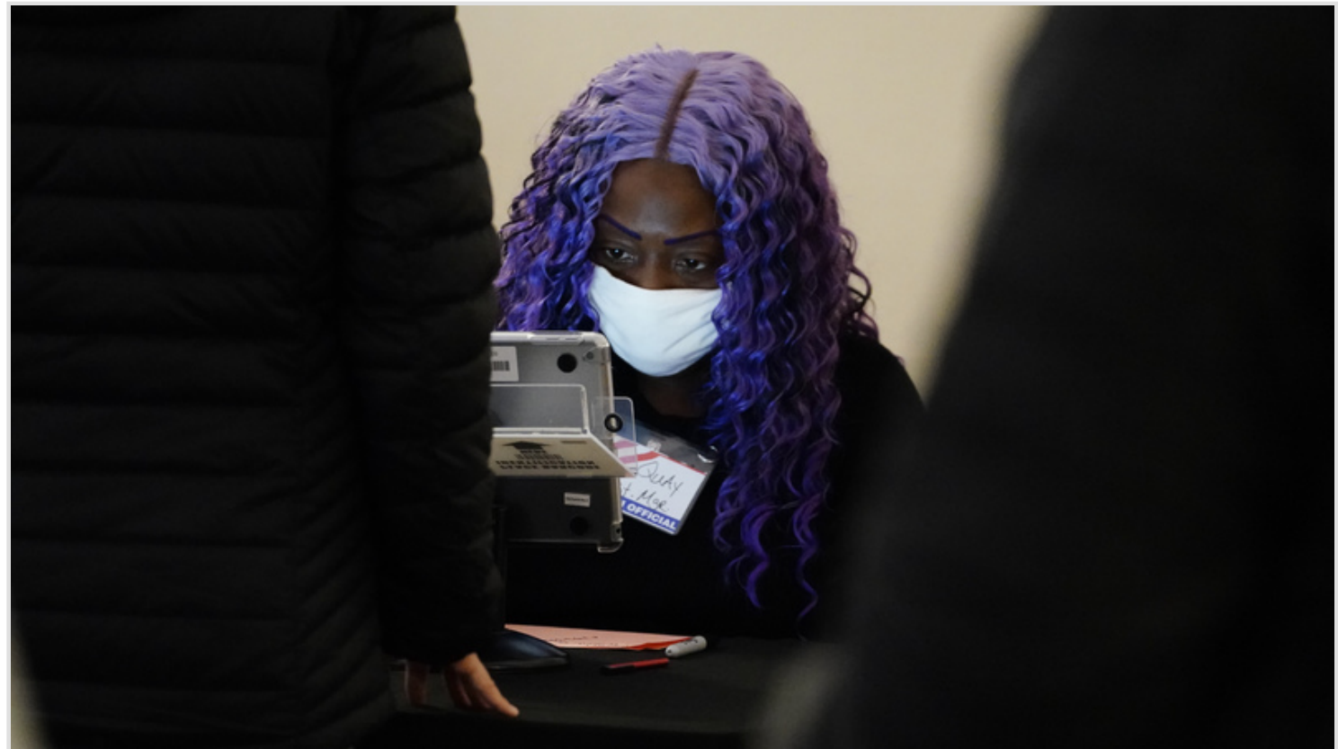
POLITICS Democrats Win 1 Of 2 Georgia Races, With Senate Control In Sight