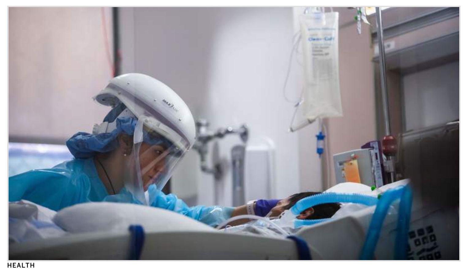
LA County Paramedics Told Not To Transport Some Patients With Low Chance Of Survival