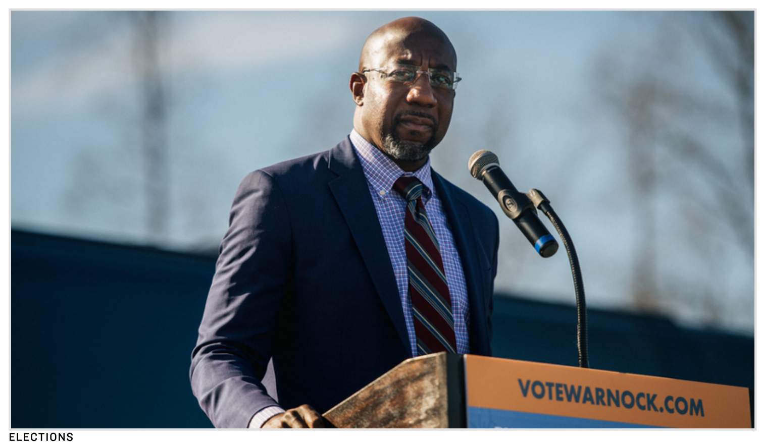
Democrat Raphael Warnock Wins Georgia Runoff