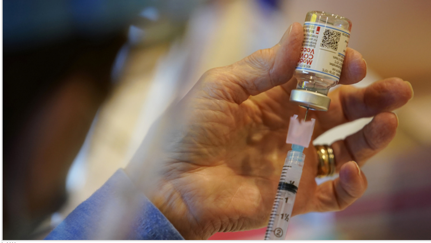
Some Health Care Workers Say They Are 'Forgotten' In COVID-19 Vaccination Plans