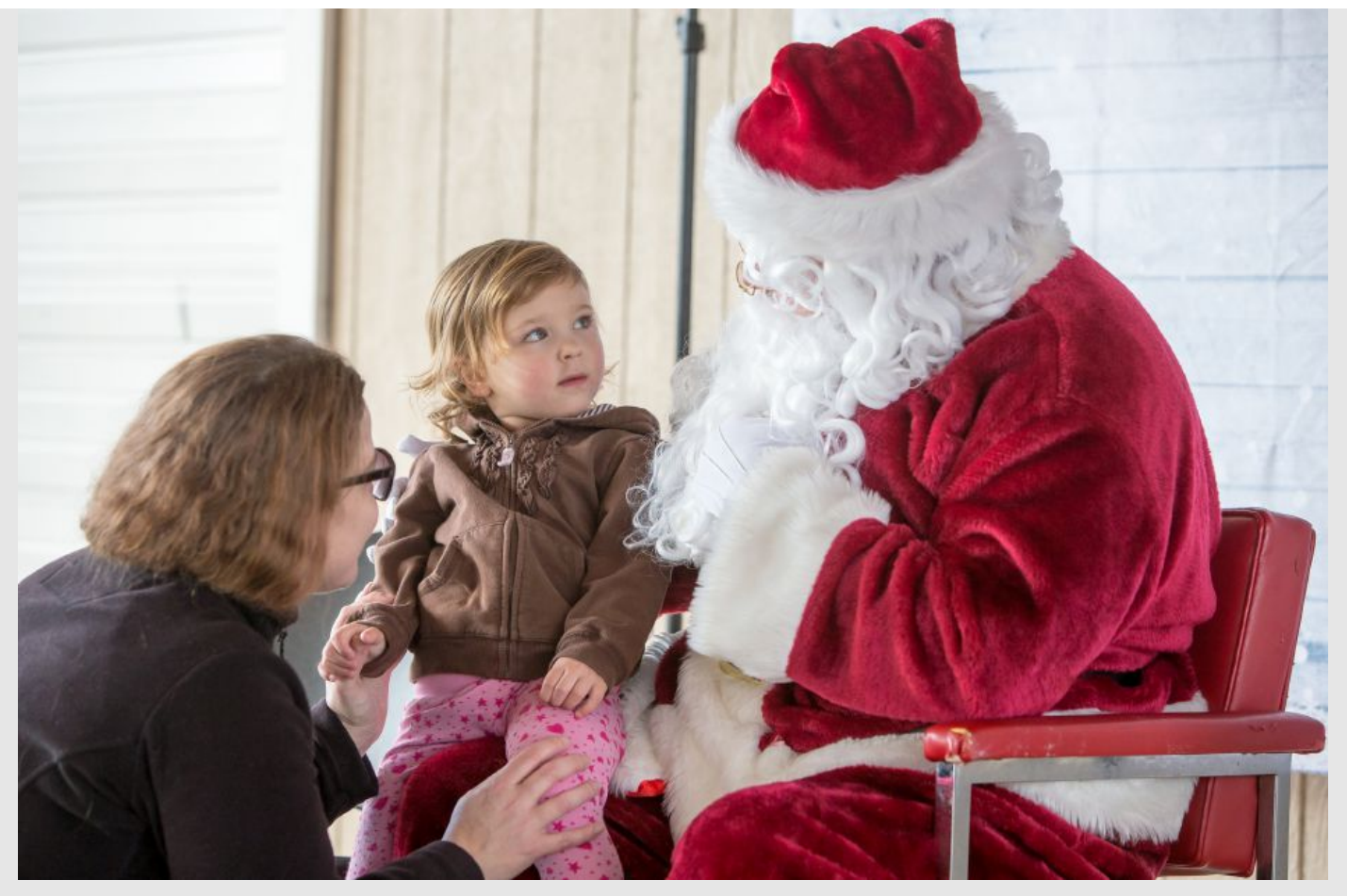
EDITORIAL: 11 things we liked this week, 2 we didn't Posted Dec 05 2019