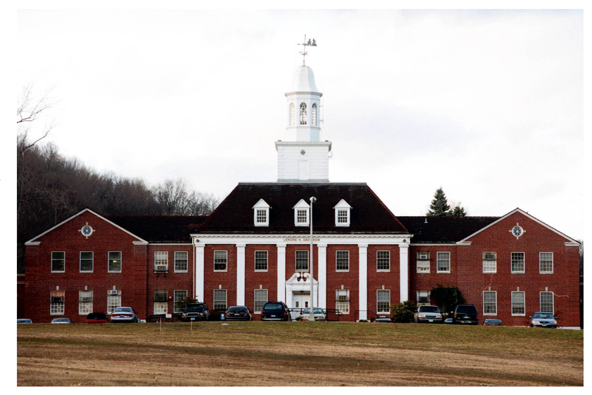
Many parents of developmentally disabled adults point to the extremely high cost of keeping Southbury Training School open as a significant barrier to serving more people with residential placements.

The Connecticut provider community is qualified and experienced to safely support resi-