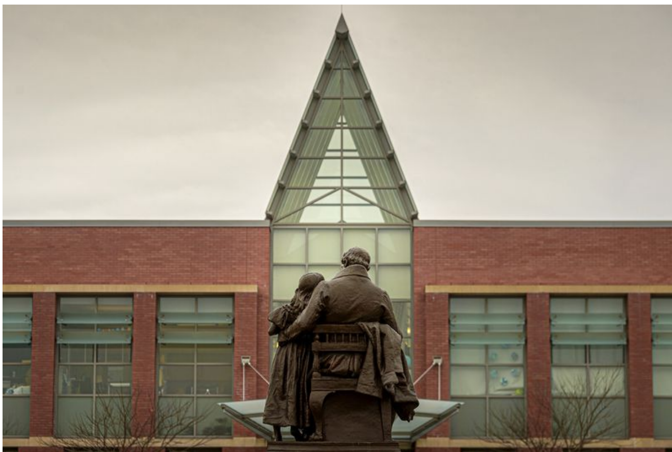
West Hartford, Ct. - 02/25/2020 - A statue in front of the American School for the Deaf memorializes the schools founder Joseph Gallaudet. Last week an ASD report was released identifying 75 credible allegations of abuse of young students by faculty, staff and a former director.