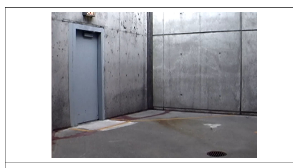
Figure 6 "Recreation Cage"

and 7, also taken from the documentary The Worst of the Worst: Portrait of a Supermax (2012), show the "recreation cage."