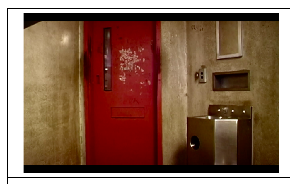
Figure 5 Sink and Door

36. A prisoner's access to fresh air and direct sunlight comes from a trip to what is called the "recreation cage," a space slightly larger than a cell, surrounded by approximately fourteen-foot concrete walls and topped by a steel cage. The only view is of the sky. Figures 6