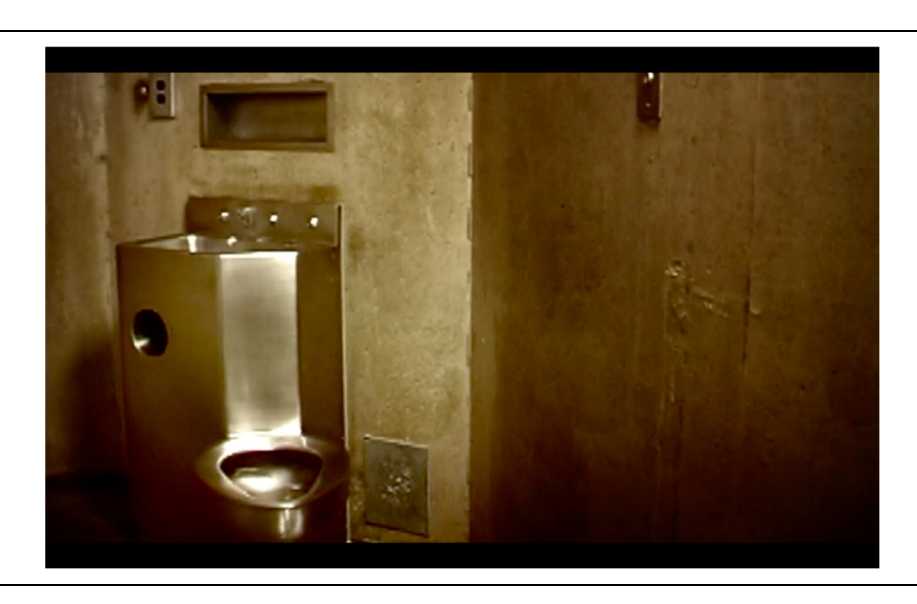
Figure 2 Sink and Toilet