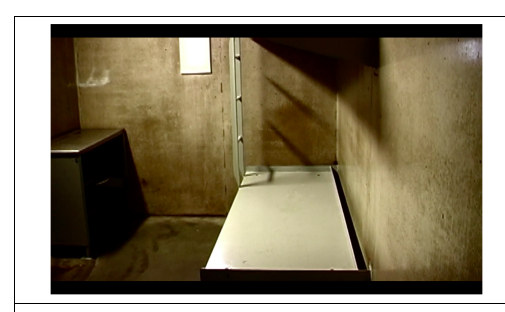
Figure 3 Bed and Desk