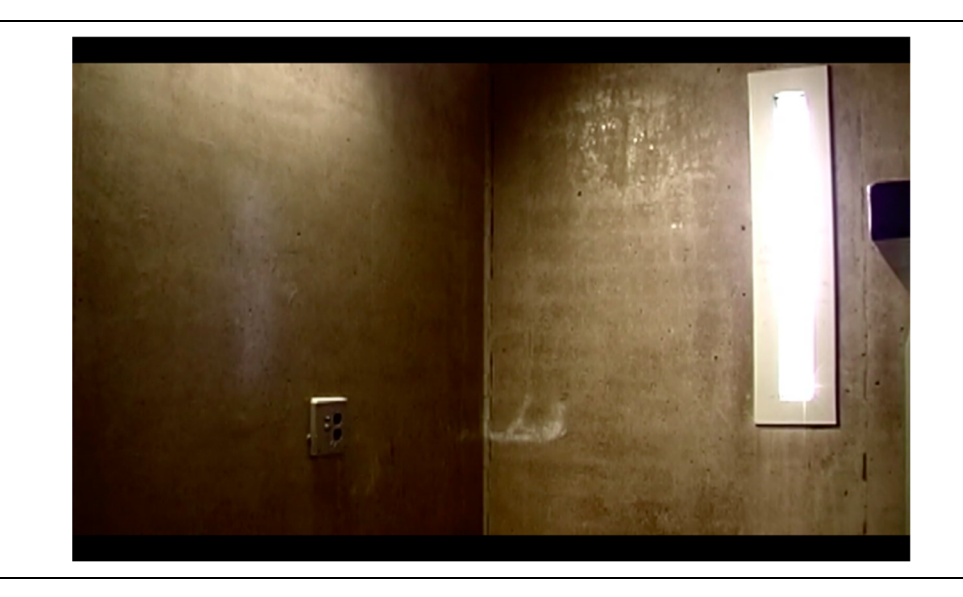
Figure 4 "Window" Slot